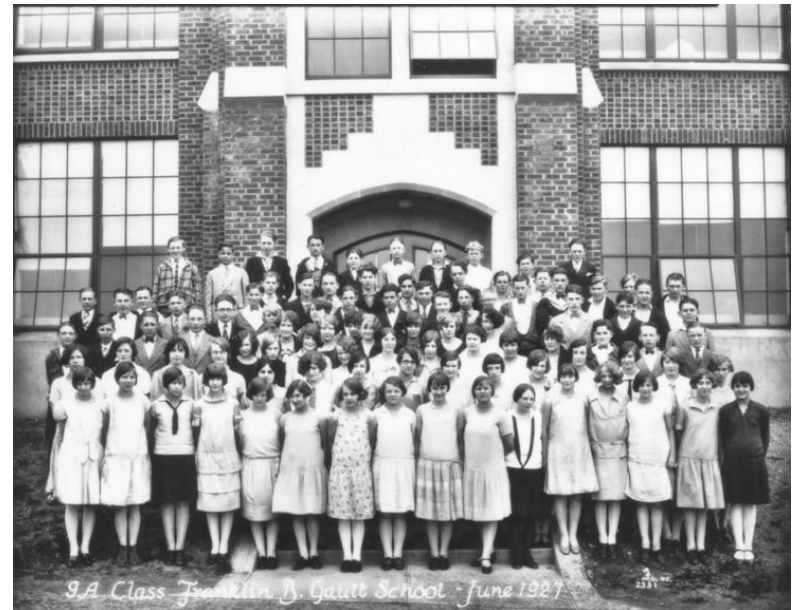
Historic photo of Gault School