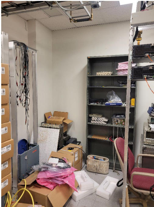
Proposed location for wall-mounted equipment