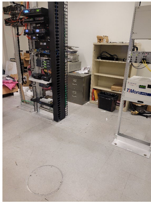
Proposed equipment rack location