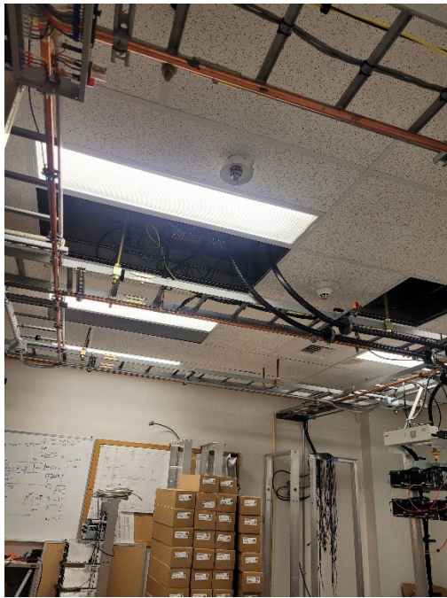
Coax path to roof