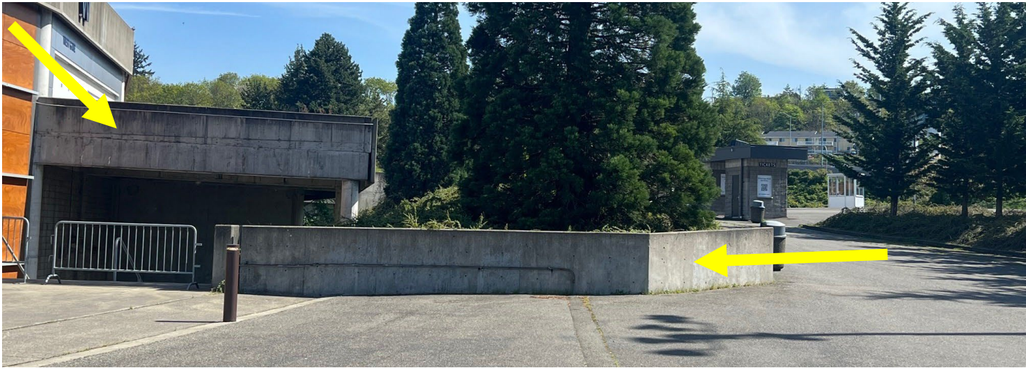
Clock Tower Front of Tacoma Dome on E D Street, 35' x7' on all four sides