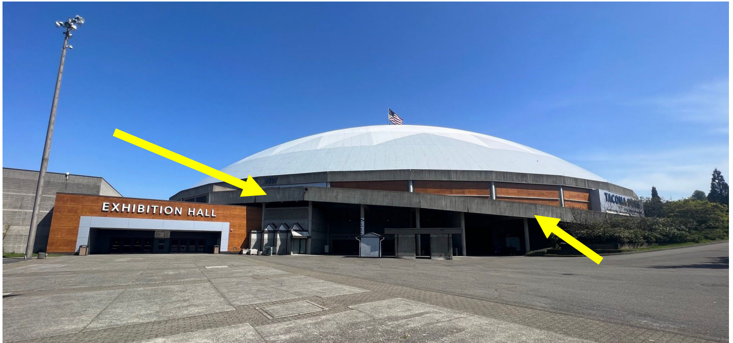
Exhibit Hall Exterior Wall

Front of Tacoma Dome on E D Street, 6' x 120'