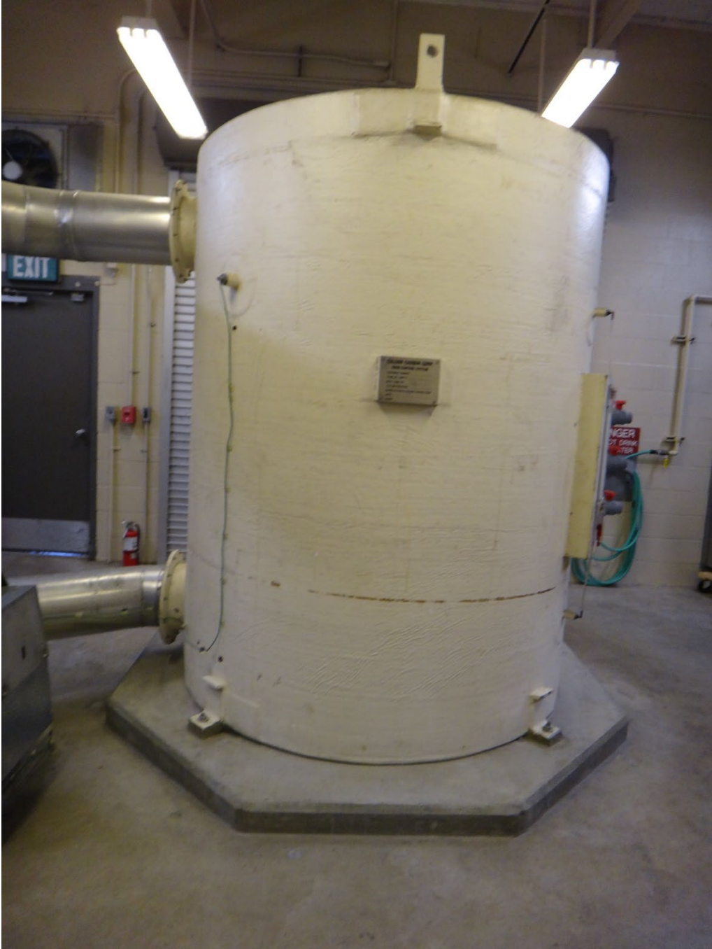
Bid item #2- Pump Station AN2202-Memorial Pump Station