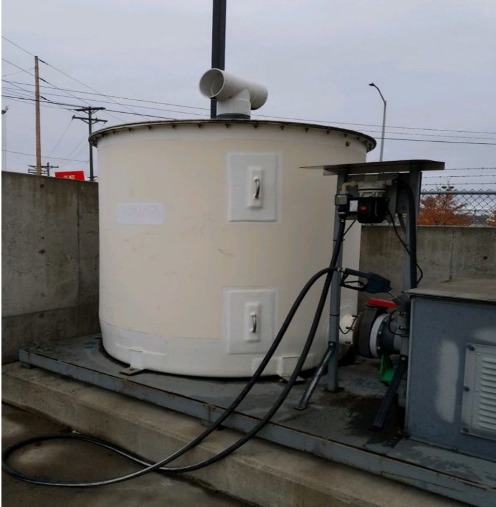
Bid Item #4 – Cleveland Decant Facility