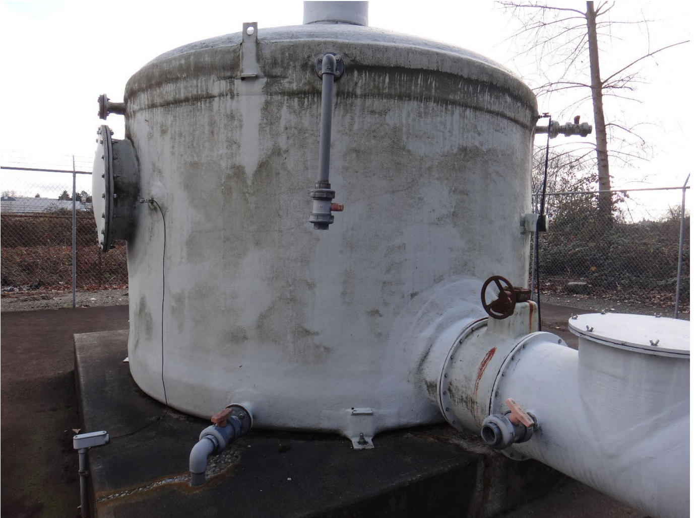
Bid item #3- Pump Station AN2202-South Tacoma Pump Station