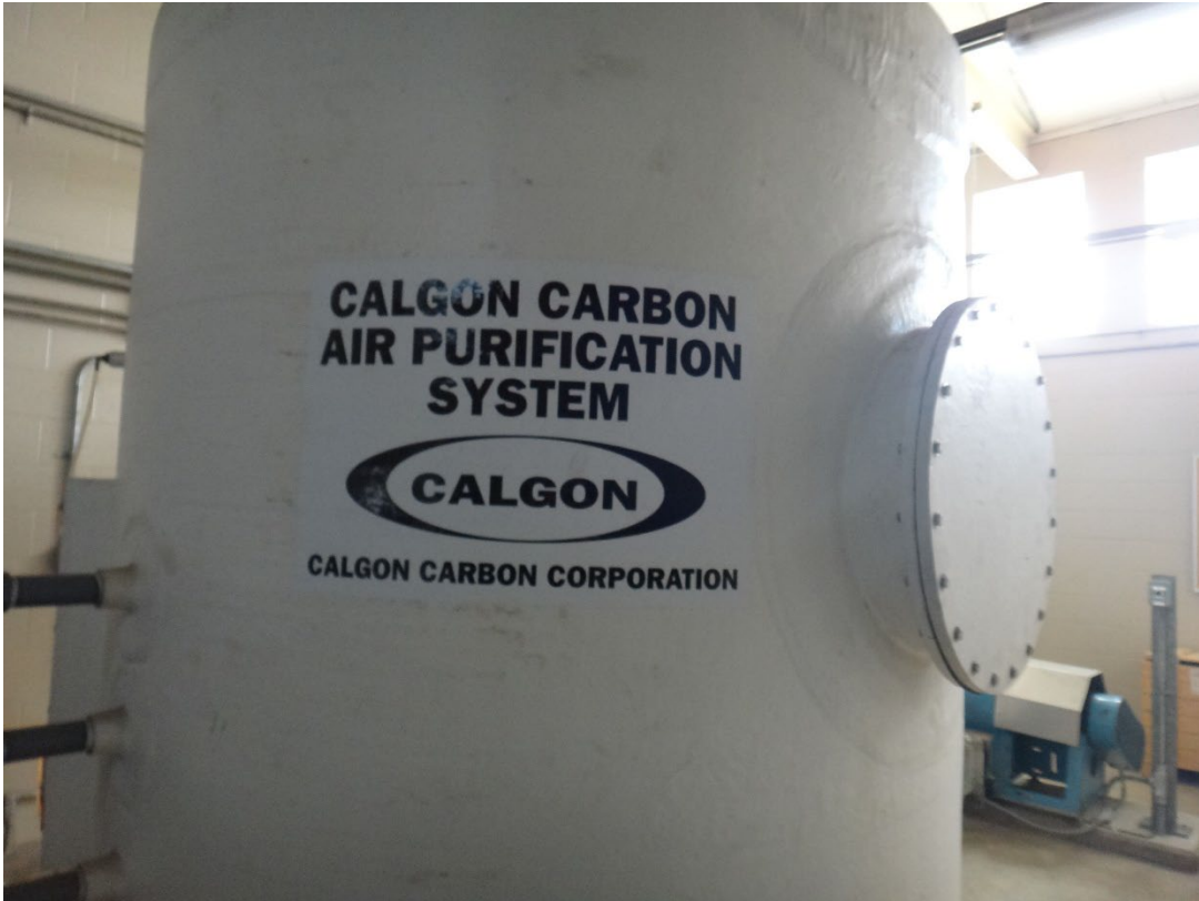
Bid item #1 Pump Station AN2204-Grandview